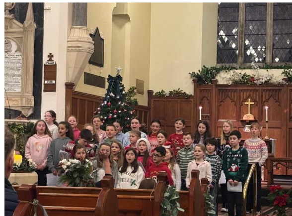
Choir singing at Whitechurch Parish