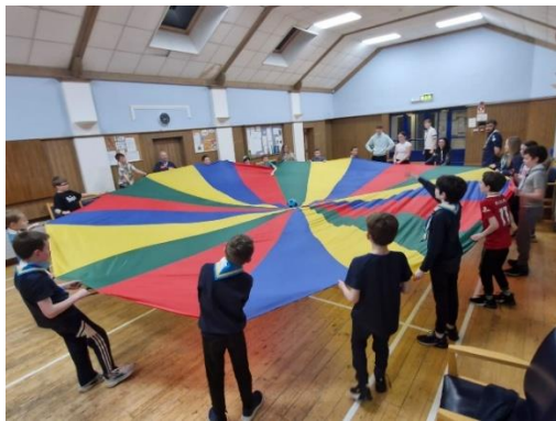
The new cubs had their first sleepover in the parish hall.