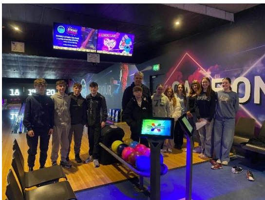
On Sunday 9th February the Senior Youth Club went bowling in Leisureplex Tallaght. Thanks to leaders for organising such a fun evening.

The Junior Youth Club are also thriving. It is great to see young people taking part in Parish activities.