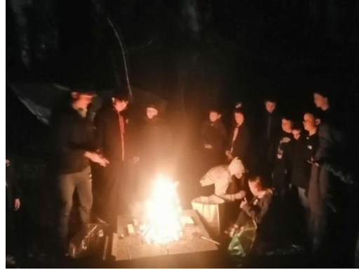
The scouts camping in the parish grounds before Christmas.