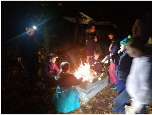
And we've been busy cooking on our open fires in "Whitechurch Woods" a lot lately.