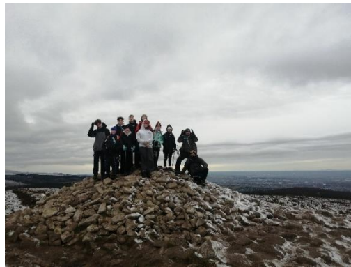
Finally, the scouts on their second practice hike for the big one in May.